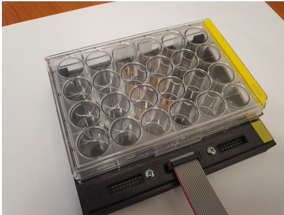
Image 2 - Device with fitted multi-well plate